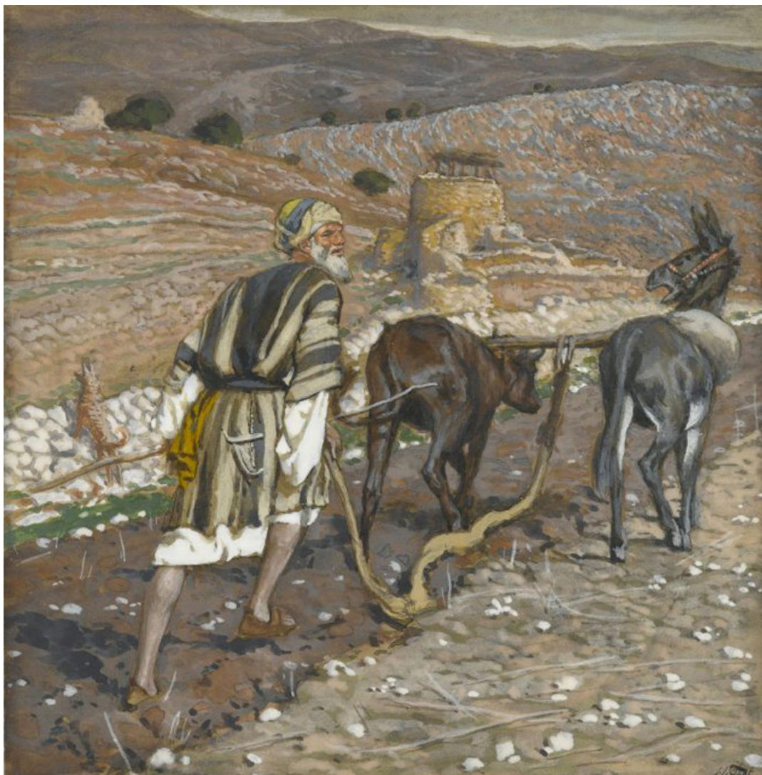
Looking Back—The Man at the Plow by James Tissot